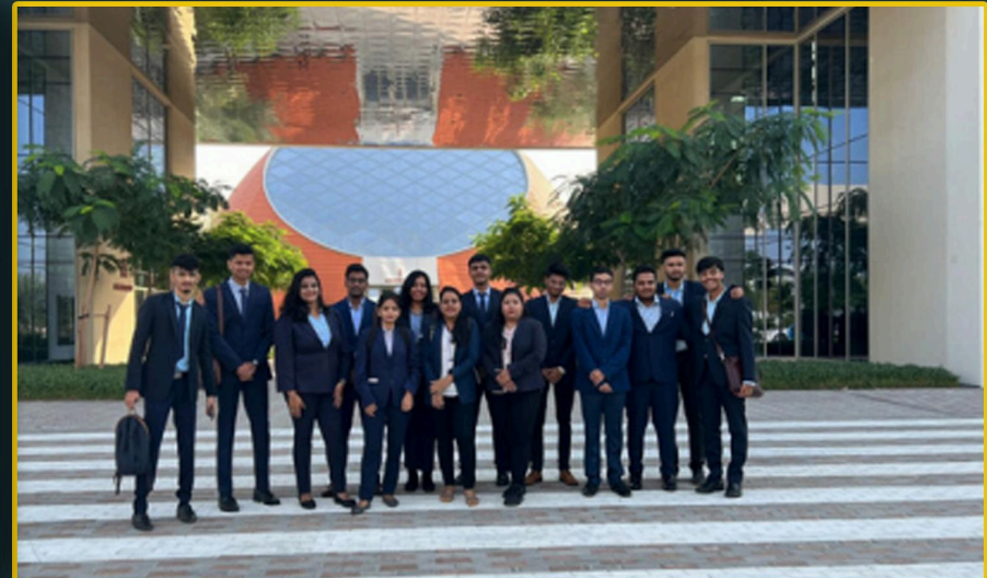
Industry Visit at Dubai