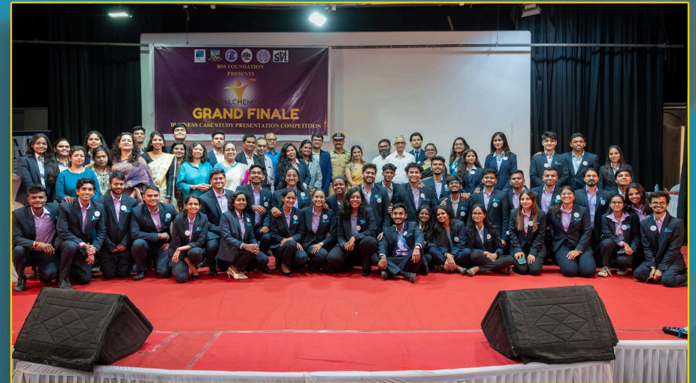
Case Study Grand Final