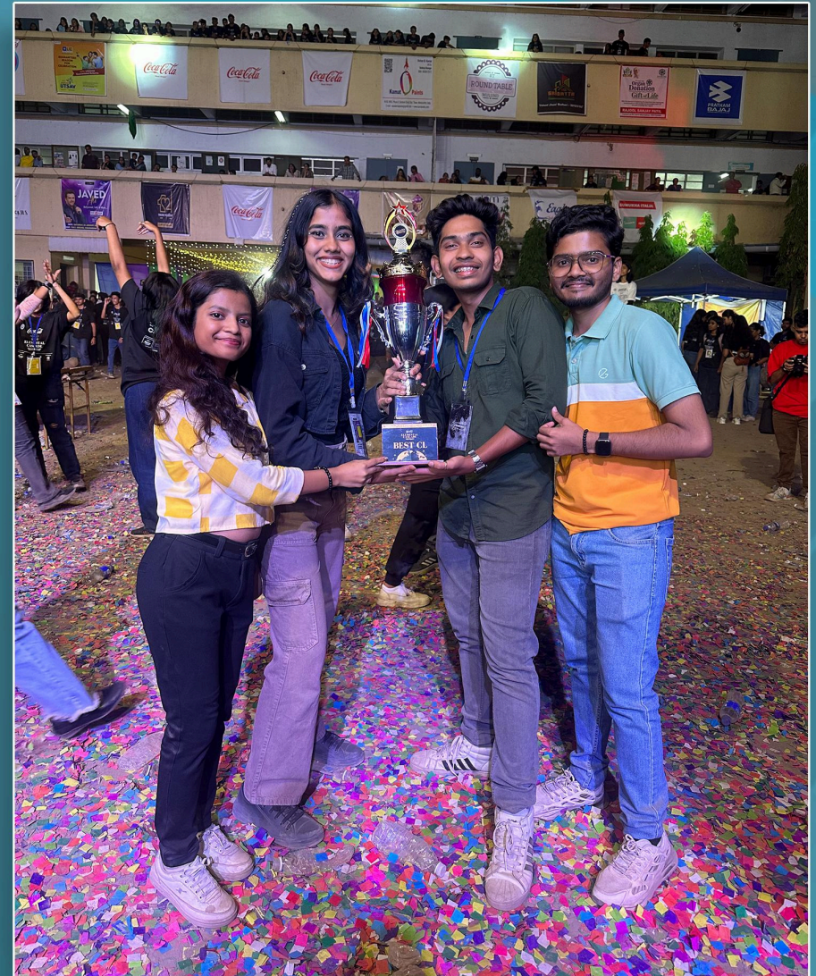
Best Contingent Leader Award