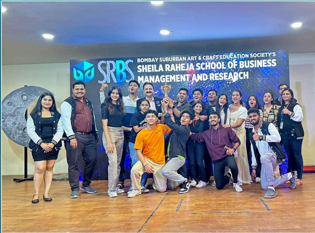
Best College Award