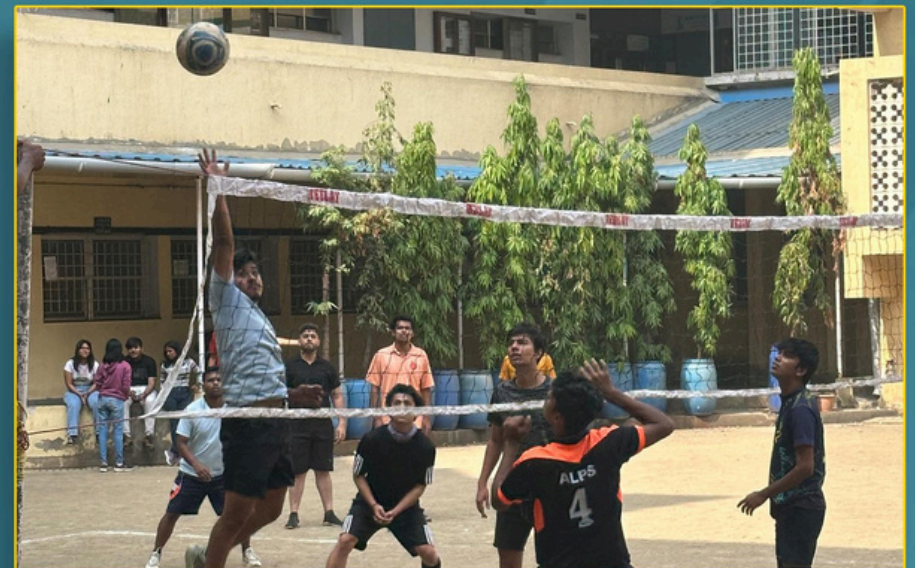
Annual Sports Day 2024