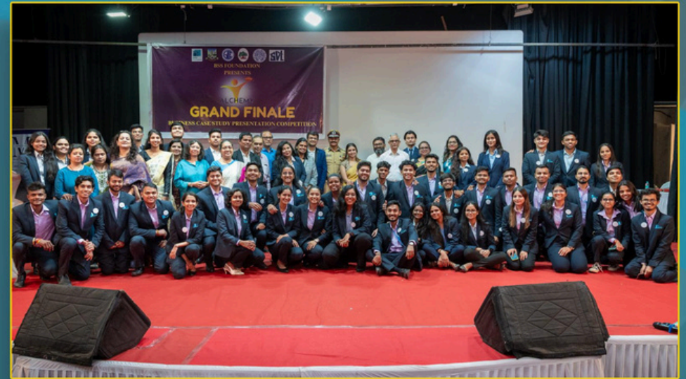
Case Study Grand Final