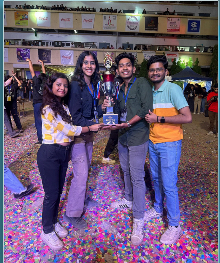
Best Contingent Leader Award