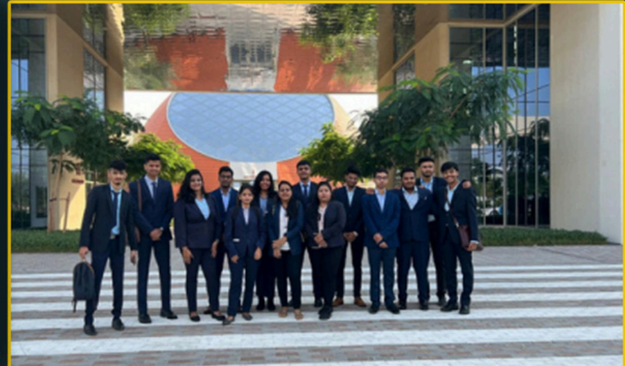
Industry Visit at Dubai