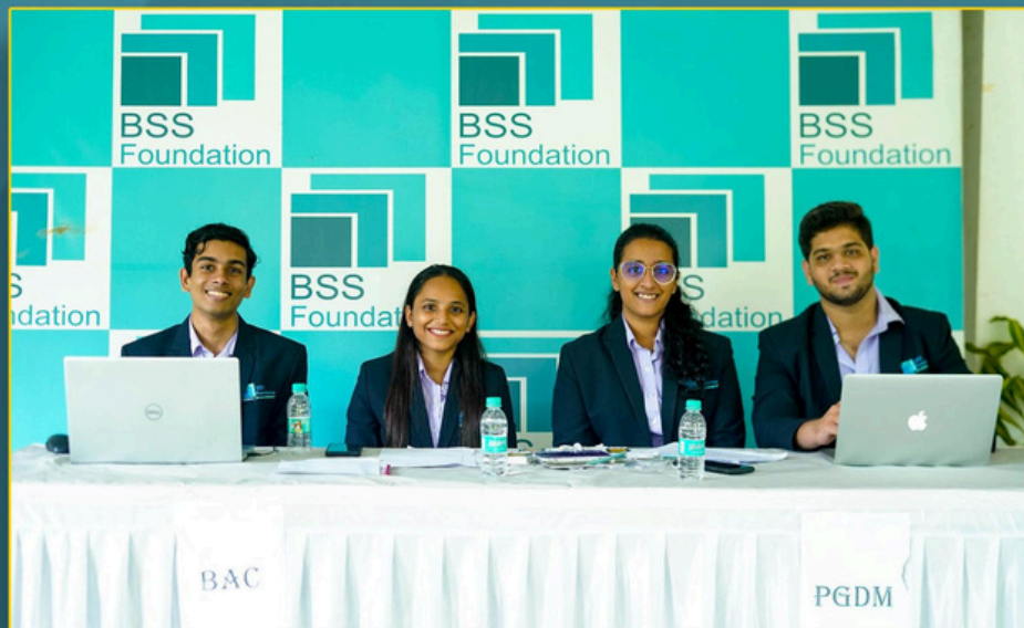
Induction Program 2024