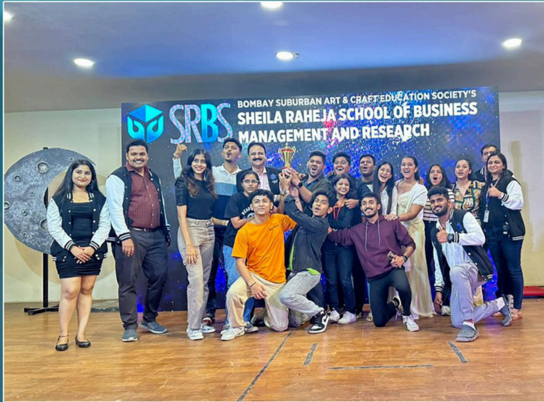
Best College Award