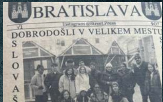
Bratislava international newspaper