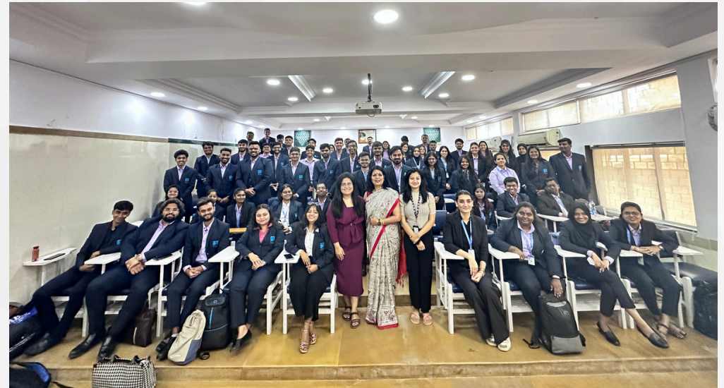
TCS Placement registration round for our masters students

The Career Support Cell at BSS Foundation – School of Management is dedicated to guiding students toward successful career paths through continuous mentoring, training, and industry engagement. Our cell bridges the gap between academic learning and professional readiness by providing placement assistance, internship opportunities, and career counselling. We work closely with top recruiters and industry experts to prepare our students for a dynamic and competitive job market.